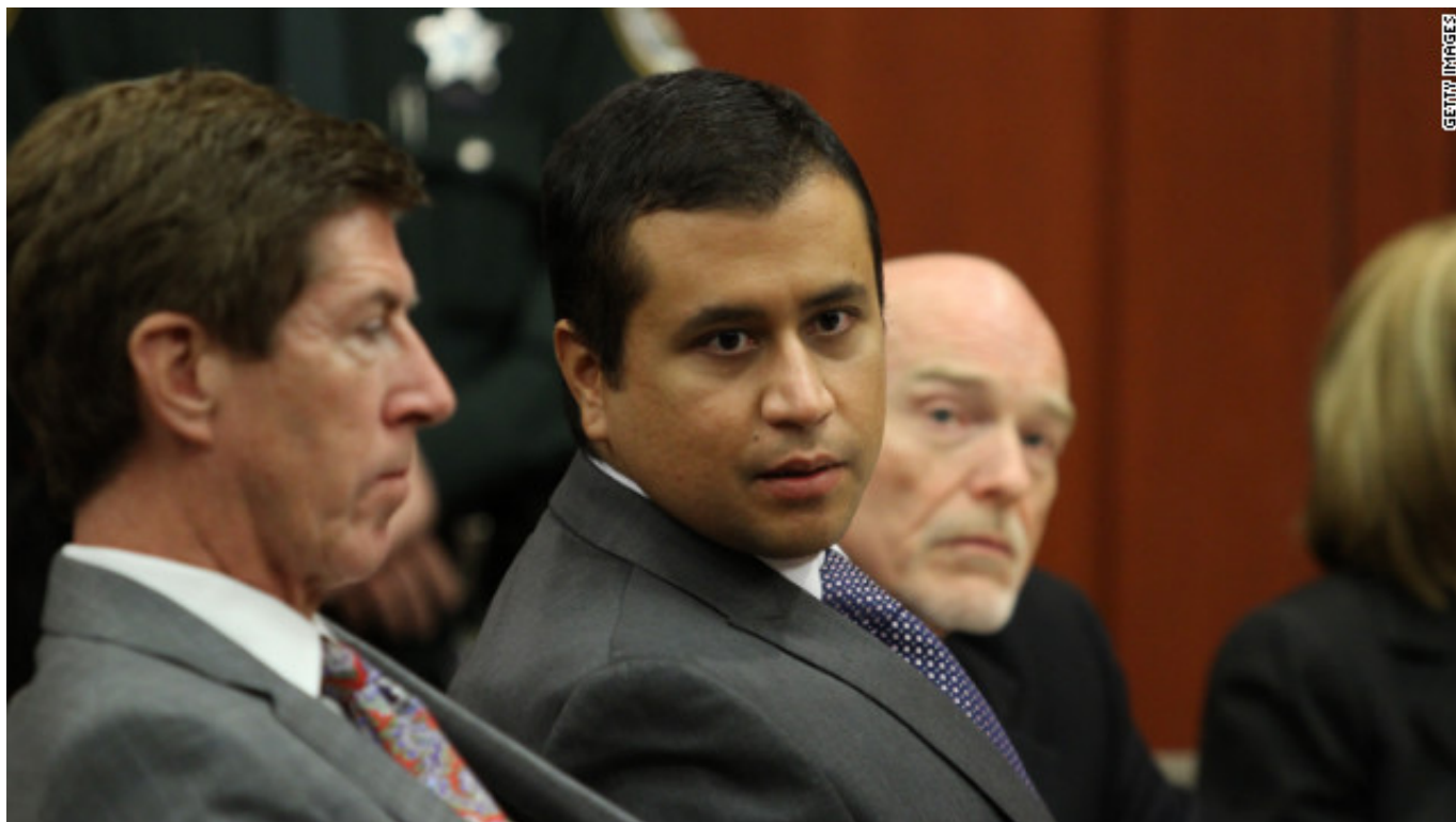
George Zimmerman's Lawyer Requests New Judge In Trayvon Martin Case